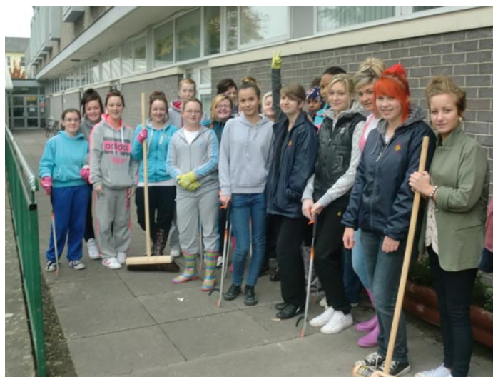
TY Cleaning the grounds and the grotto of the school