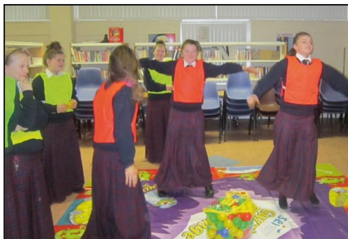
Students from 1st Year using lots of energy playing the Energy Guzzler Game on the environmental Day of Action. Well done, girls.